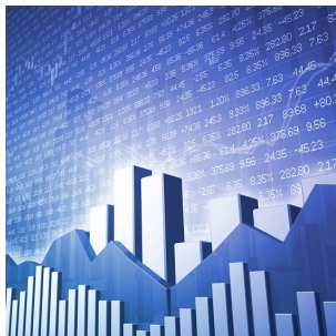
Chart reflects price changes, not total return. Because it does not include dividends or splits, it should not be used to benchmark performance of specific investments.